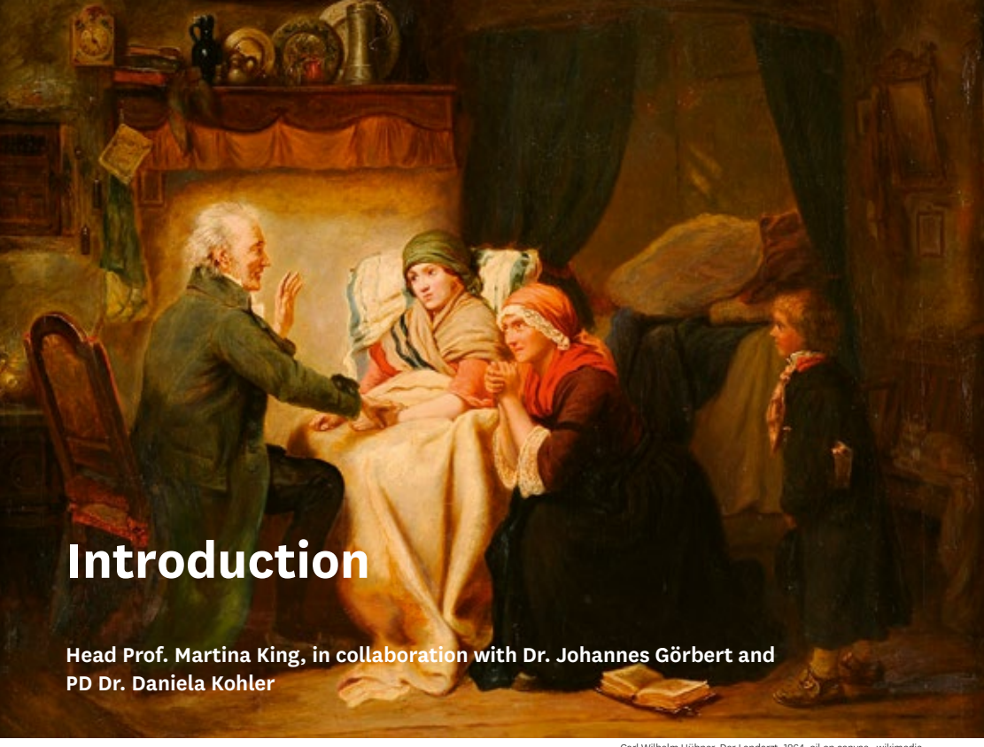
Carl Wilhelm Hübner Der Landarzt 1864 oil on canvas wikimedia

What is medicine? Is it a scientific discipline? Is it an activity concerned with healing and caring for the sick? There are no easy answers to these questions. Our programme sets out to address them. Medical Humanities is not an independent subject, but rather the conception of a curricular reform drawing on various humanities and social sciences: ethics, history, literature, anthropology, sociology, as well as economics and law. These disciplines all contribute to a critical examination of medicine as a complex system. After all, 'medicine' does not only consist of objective knowledge, but it also constitutes a space of social relationships where people meet and communicate. It involves happiness and suffering, death and birth, i.e. major questions of human existence. Dealing with these issues places high demands on young doctors, which is why we want to think together about what being a doctor