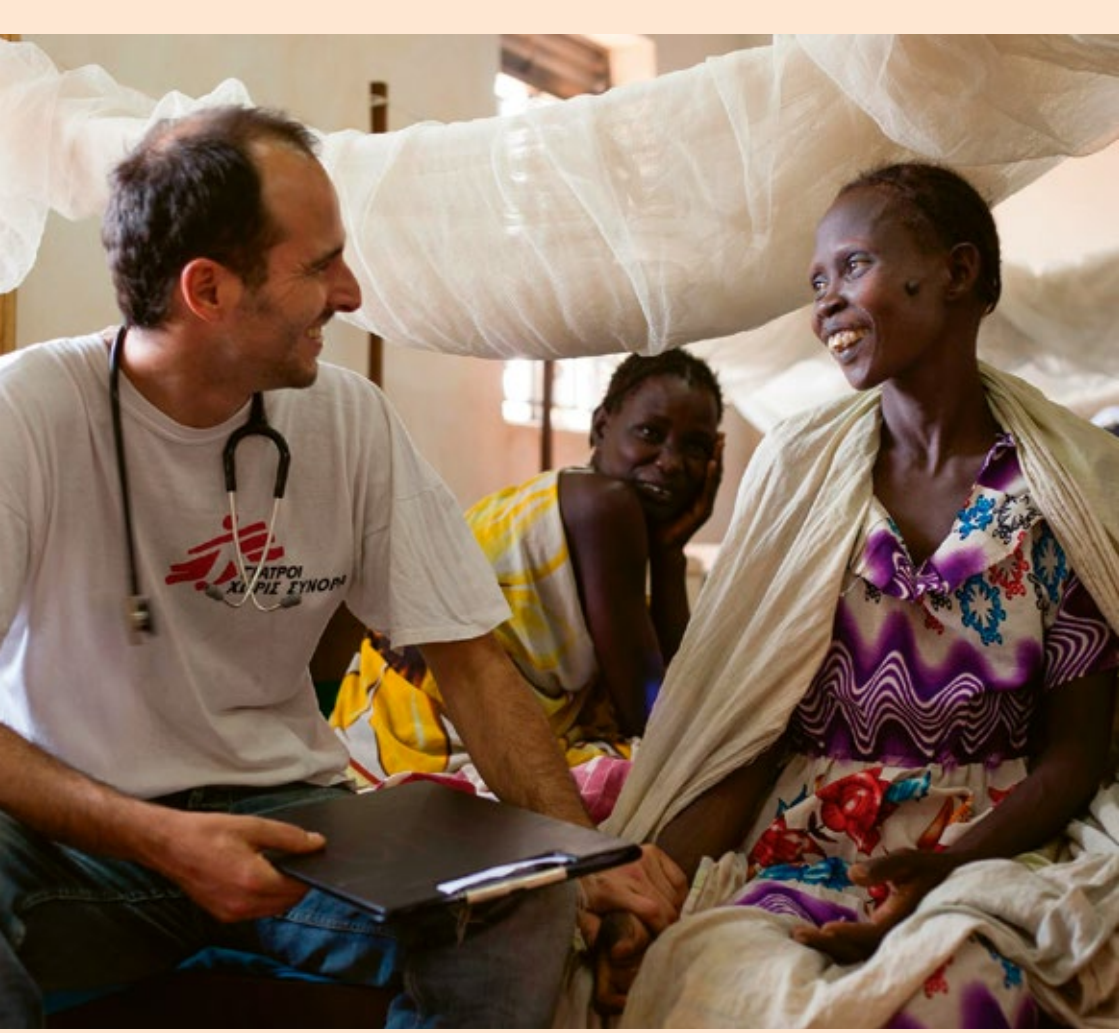
Medecins sans frontieres / Doctors without borders, www.msf.org.uk/get-involved